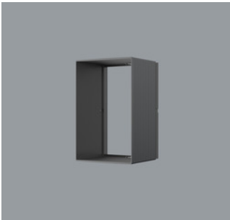
70609.000 Snoot Polymer. Black