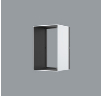
79839.000 Snoot Polymer. White