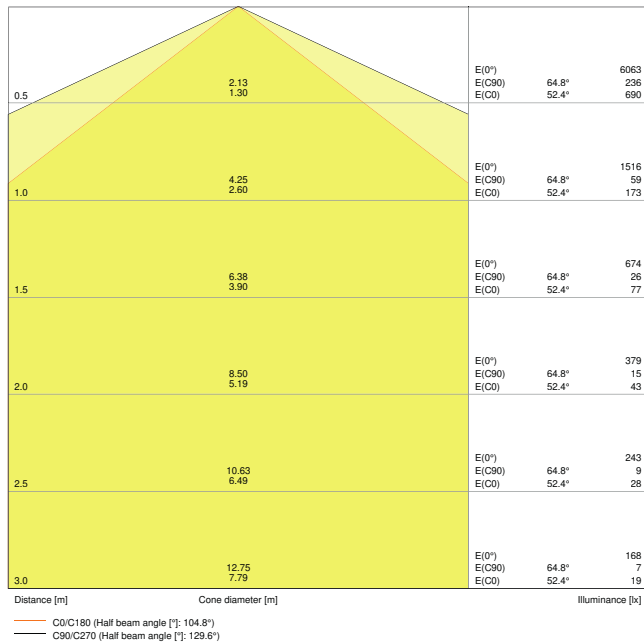
LDC typ cone